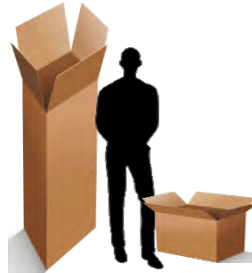
Appliance or Cardboard boxes

The Town will NOT collect yard waste in plastic bags. Residents who wish to use plastic bags should contact their waste hauler for a price quote for yard waste collection. Do not mix household refuse (paper, plastic, metal, etc.) with yard waste, or it will not be collected.