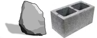
Stones & Masonry Block or any construction debris