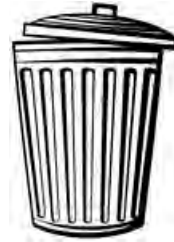
50 lbs. or less